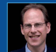
Prof. Simon Baron-Cohen Director of the Autism Research Centre